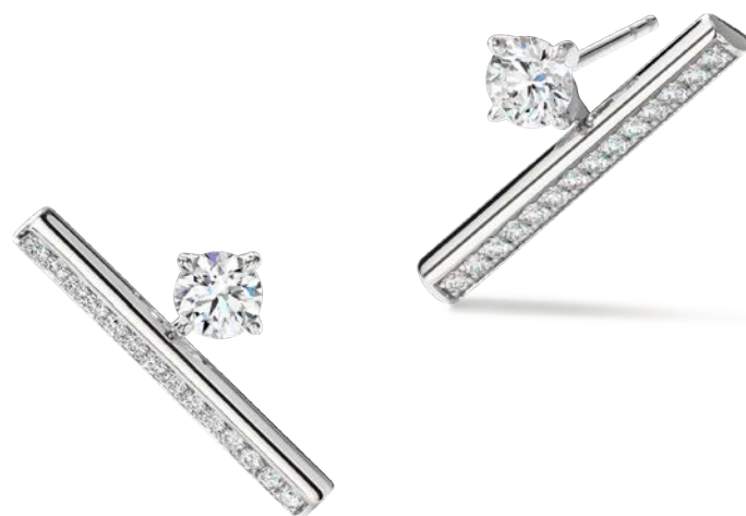
FLOATING DIAMOND PENDANT NECKLACE FLOATING DIAMOND SMALL HOOPS FLOATING DIAMOND LARGE HOOPS SINGLE DIAMOND PAVÉ CLIMBER EARRINGS