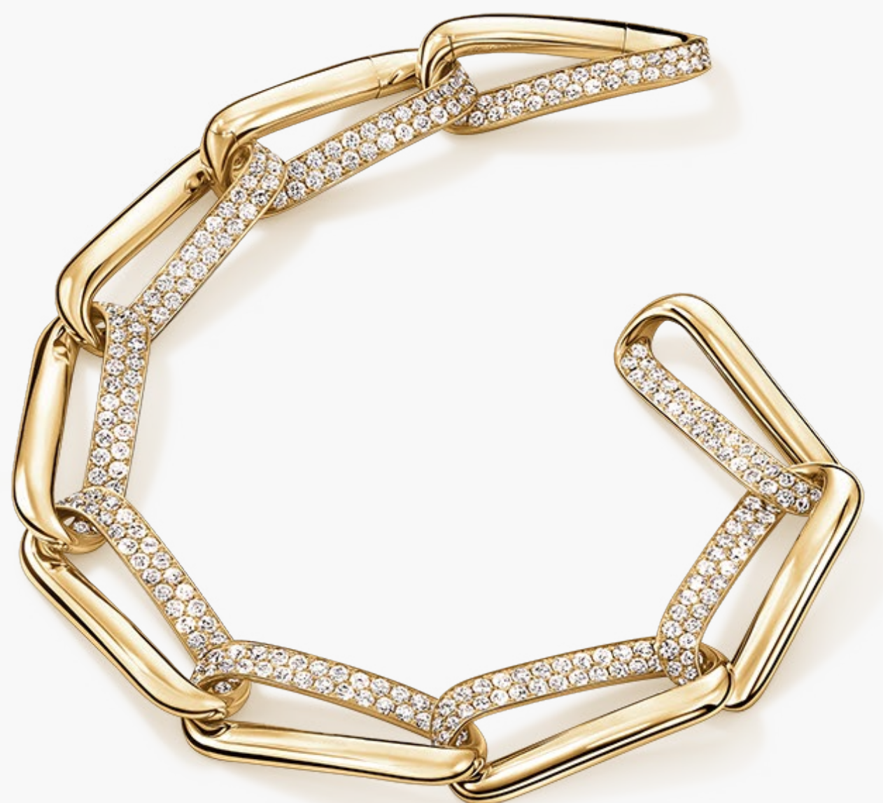
DIAMOND FLEXI BANGLE DIAMOND LINK NECKLACE DIAMOND FLIP HUGGIES DIAMOND LINK BRACELET