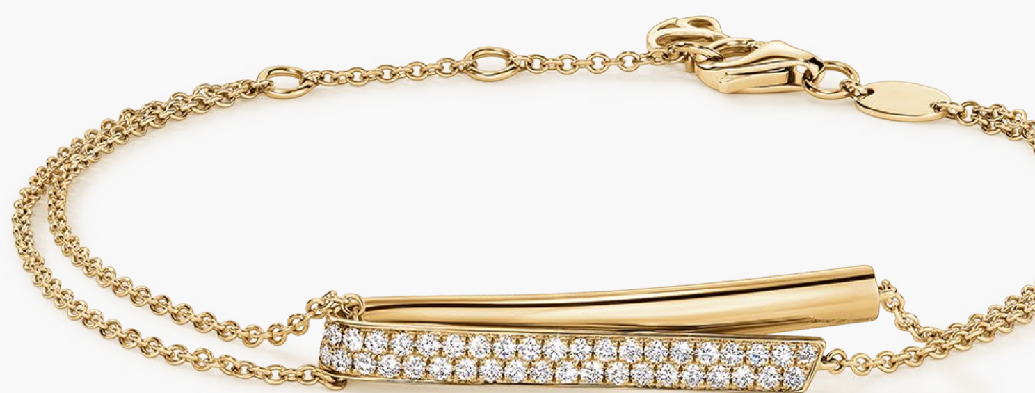
DIAMOND FLIP PENDANT NECKLACE DIAMOND FLIP RING DIAMOND FLIP OPEN RING DIAMOND FLIP BRACELET