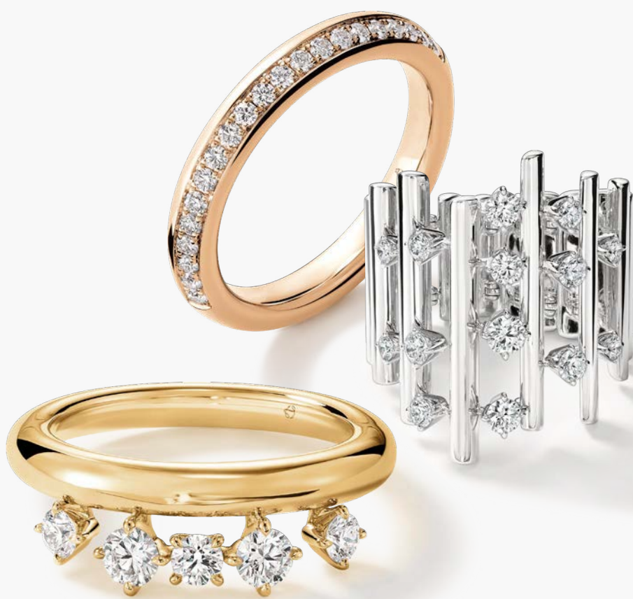
MULTI-ROW DROP EARRINGS MULTI-ROW BRACELET PAVÉ BAND MULTI- ROW DIAMOND RING FLOATING DIAMOND RING