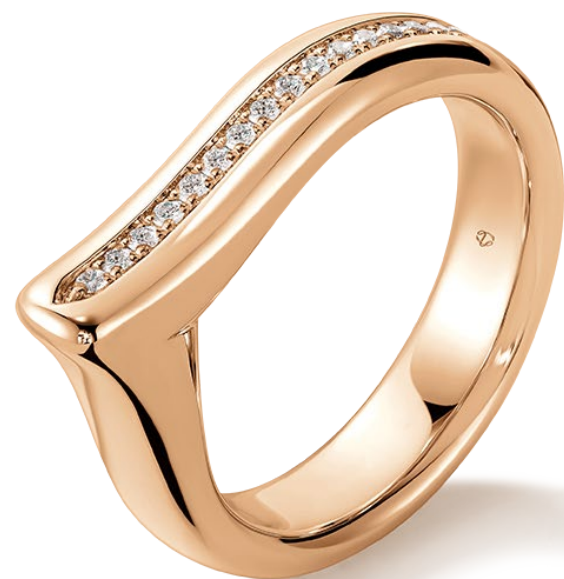
DROPLET PENDANT DROPLET STUDS DROPLET STILETTO EARRINGS DROPLET BRACELET DROPLET OPEN RING DIAMOND BAND