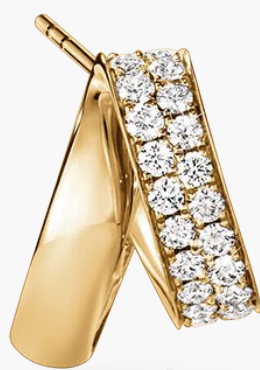
DIAMOND FLIP BANGLE DIAMOND TRIO BAND DIAMOND FLIP CHOKER DIAMOND FLIP EARRINGS