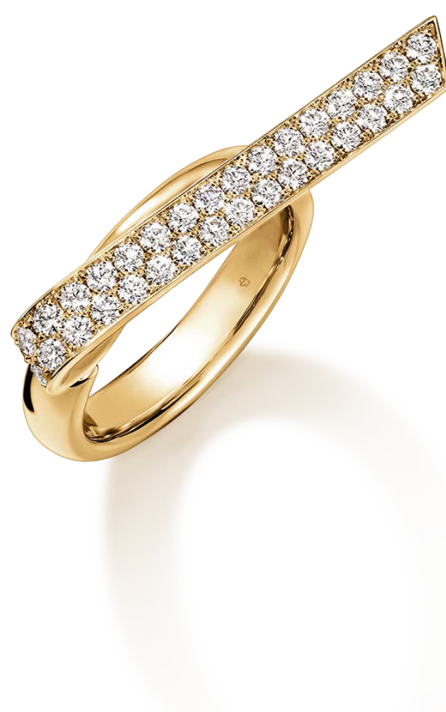
MULTI-WEAR RONDEL DIAMOND PENDANT NECKLACE DIAMOND LINK EARRINGS, LARGE ELONGATED DIAMOND FLIP RING