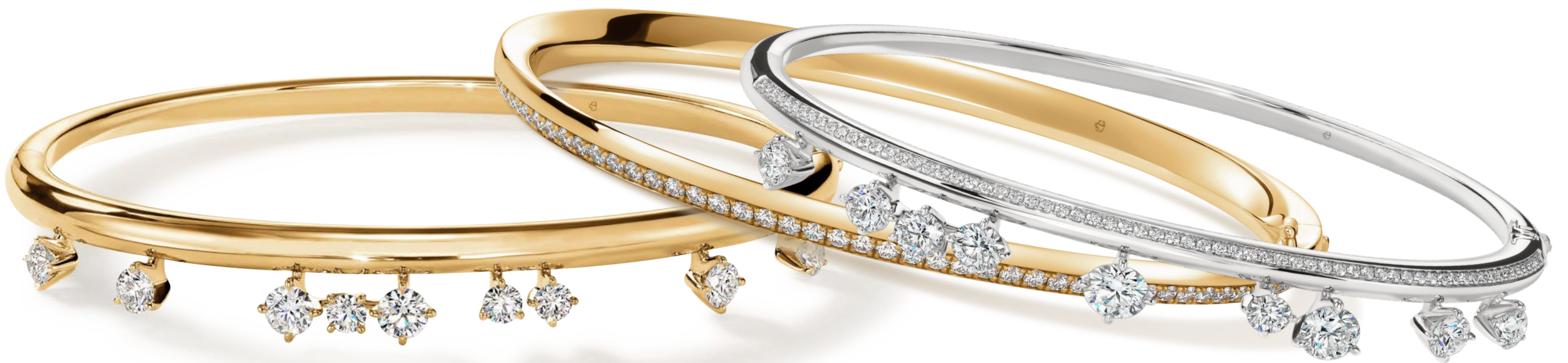
FLOATING DIAMOND CHOKER MULTI-ROW CLIMBER EARRINGS FLOATING DIAMOND BANGLE PAVÉ BANGLE FLOATING DIAMOND PAVÉ BANGLE