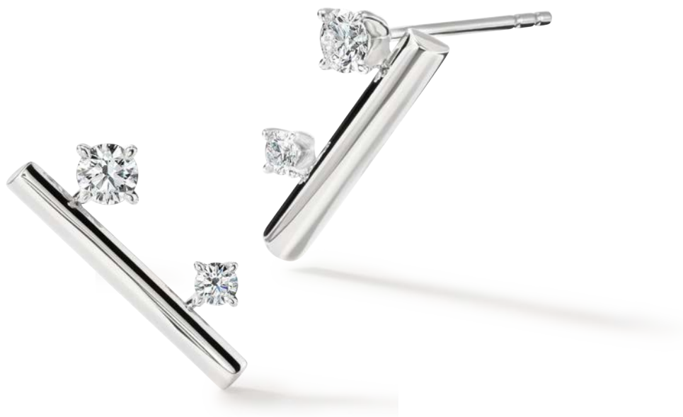
FLOATING DIAMOND PAVÉ NECKLACE FLOATING SINGLE DIAMOND PAVÉ NECKLACE FLOATING DIAMOND MEDIUM HOOPS FLOATING DIAMOND CLIMBER EARRINGS