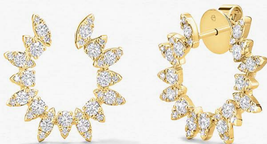
LUNAR ECLIPSE PENDANT SMALL ECLIPSE LARGE PENDANT DEWDROP BRACELET MARQUISE FLEXI BANGLE SUNBURST WRAP EARRINGS SMALL